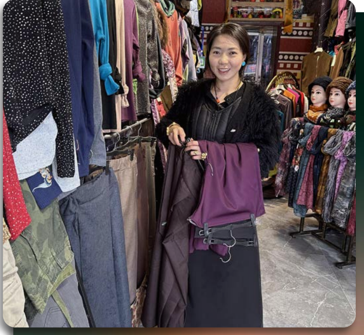
some of the graduates in their place of employment