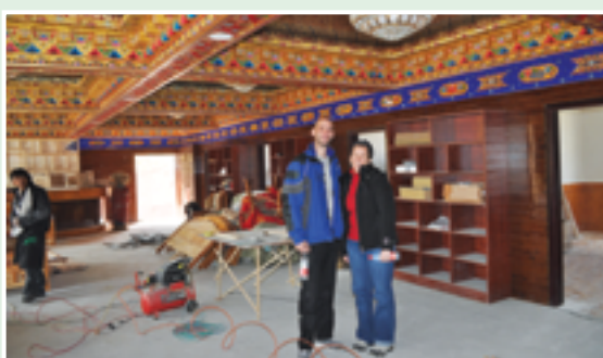
As a big step towards sustainability, a tearoom and guest-house was completed to be run by the older girls from the home with all proceeds supporting the SGVTS.

Be sure to read our BLOG for this project. Go to www.captivating.org and select the BLOG button.