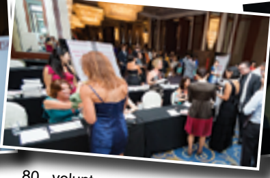
80 volunteers made the Annual Charity Auction 4th biggest and best event ever. our