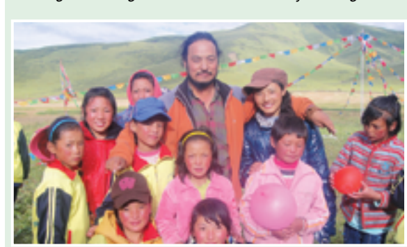
A highlight each year is when all the girls come together over the [short] summer to celebrate the forming of the school. August 2012 was the 7th year celebration.