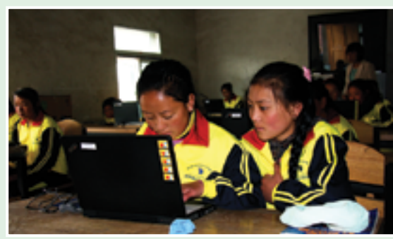
Our long-awaited computer facility is finally in place with older girls starting to learn the basics. Very exciting.