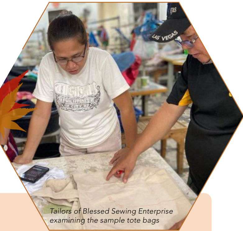
Tailors of Blessed Sewing Enterprise examining the sample tote bags