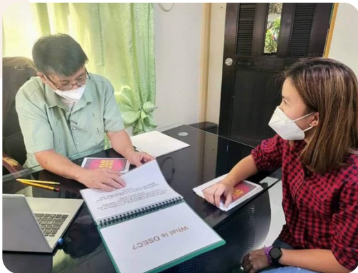
Honor staff meeting with school official in Region 3

Eleven top teachers from an elementary public school in Metro Manila were trained about the realities of OSAEC and how to protect students from exploitation. Throughout the discussion, teachers were eager to ask questions and learn about how they can help. They agreed that their role as teachers is very important. They shared that most students share family problems with them. These 11 teachers will train other teachers and share with their students this important information and our activity booklet.