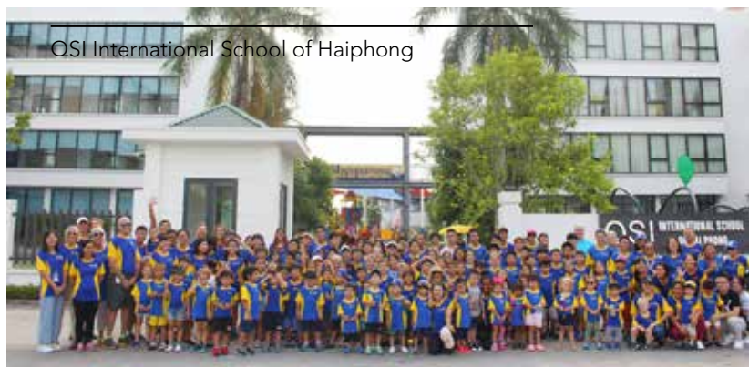
QSI International School of Haiphong

Our very first Marathon in a Month global run raised US$9,000 in October 2019. 36 runners signed up to run a marathon (42kms). We were thrilled with how our pilot event rolled out. Together, we have raised funds and awareness to help the incredible anti-human trafficking work in Nepal and the Philippines – 1K at a time.