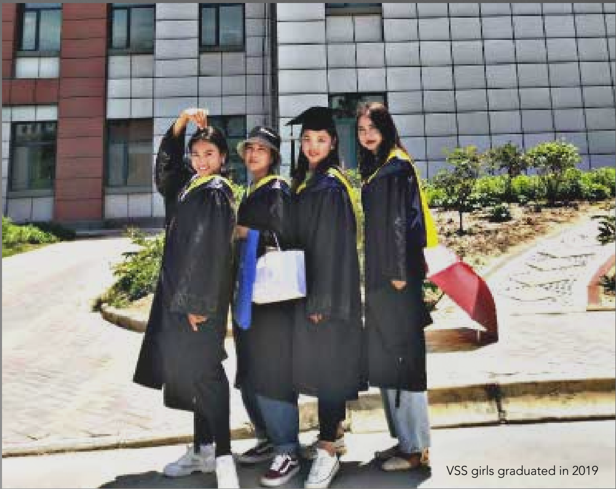
VSS girls graduated in 2019