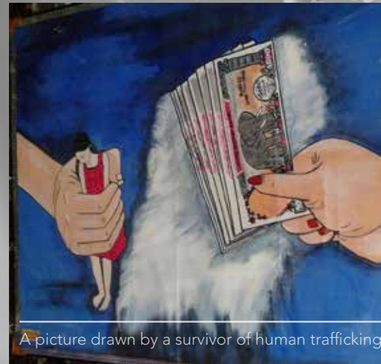
A picture drawn by a survivor of human trafficking